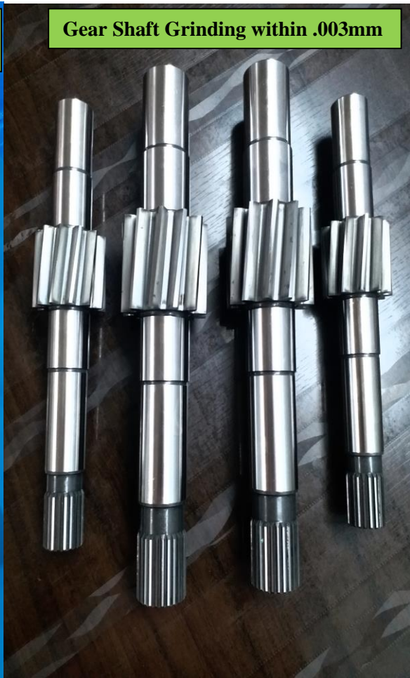
Gear Shaft Grinding within .003mm