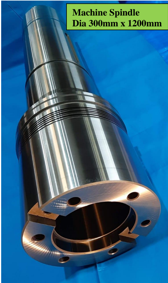
Machine Spindle Dia 300mm x 1200mm