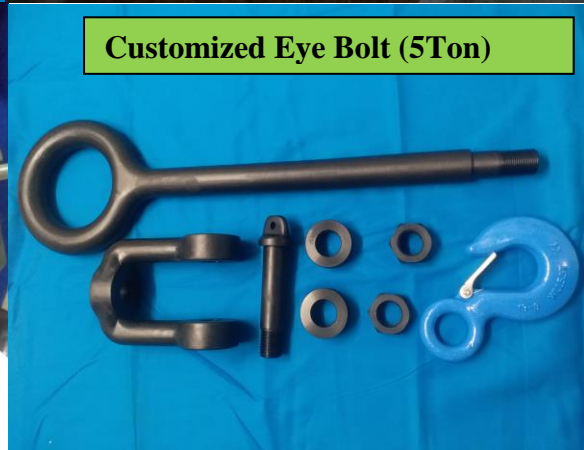
Customized Eye Bolt (5Ton)